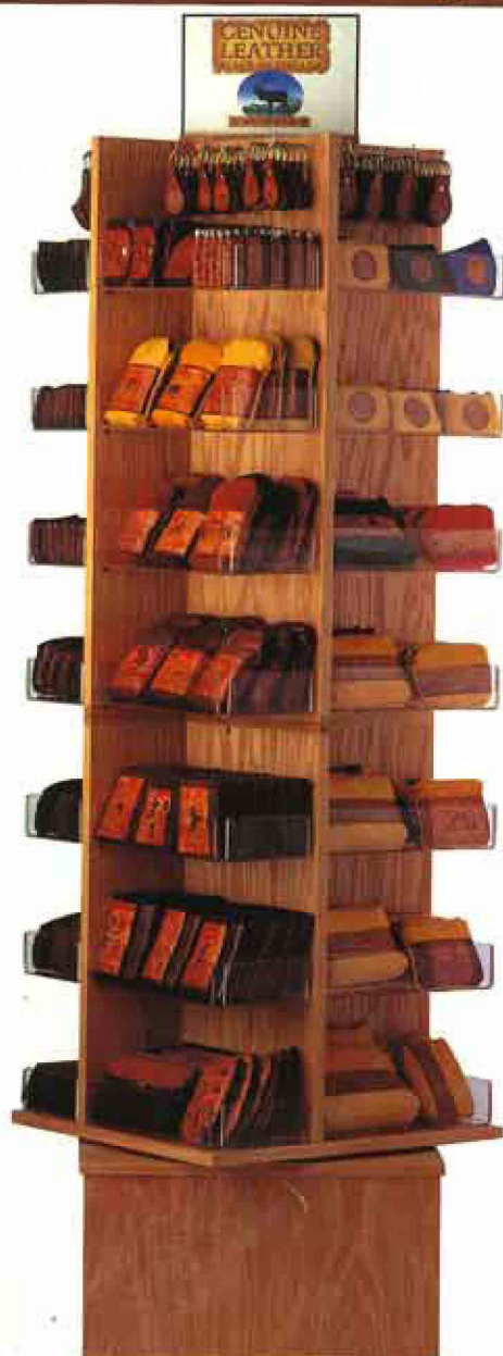
R12 LG. FLOOR DISPLAY

4 SIDED WOOD UNIT 67.5 IN. HIGH X 19.5 IN. SQUARE, ROTATES IN 27 IN. 28 TRAYS 12 IN. X 6 IN., 7 PER SIDE WITH HOOKS FOR KEY RINGS ON ALL 4 SIDES