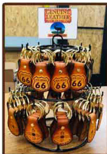
R1 ROTATING KEY RING DISPLAY 2 TIER, 11" X 8" DIAMETER

DISPLAYS ARE MADE FROM FINISHED WOOD WITH CLEAR ACRYLIC. THIS UNIT HOLDS A COMPLETE ASSORTMENT OF OUR BEST SELLERS. THIS DISPLAY COMES WITH A FULL COLOR SIGN, IN A WESTERN, WILDLIFE OR TROPICAL MOTIF.