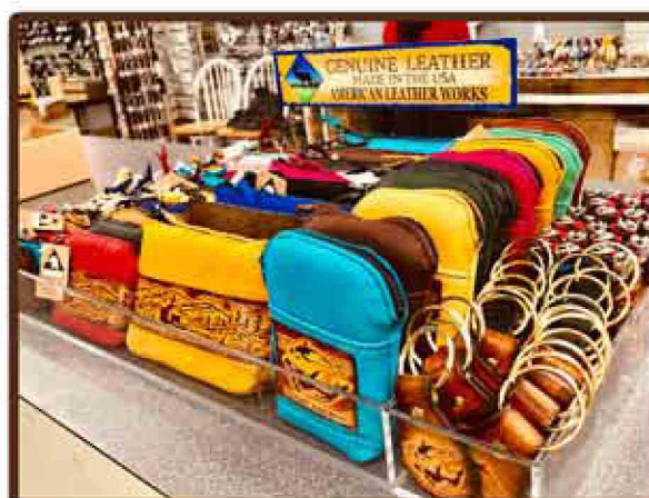
R7 COUNTER DISPLAY

10 IN. DEEP X 24 IN. ACROSS X 10 IN. HIGH, 2 TIER COMES WITH 8 ADJUSTABLE DIVIDERS, WHICH KEEPS THE PRODUCTS ORGANIZED. IT HOLDS AN ASSORTMENT OF OUR BEST SELLERS. FITS ON A SHELF OR COUNTER. A REAL SPACE SAVER. COMES WITH AN ATTRACTIVE FULL COLOR SIGN.