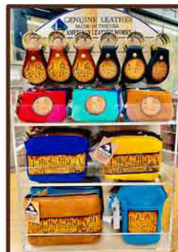
R6 WOOD & ACRYLIC REVOLVING DISPLAY WOOD & ACRYLIC REVOLVING DISPLAY NATURAL WOOD FINISH 6 HOOKS ON EACH SIDE FOR KEYCHAINS 10" DEEP X 12" ACROSS X 20 1/4" HIGH