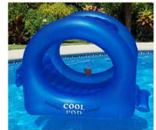
90495 Cool Pod Lounger 3/case $46.88 each