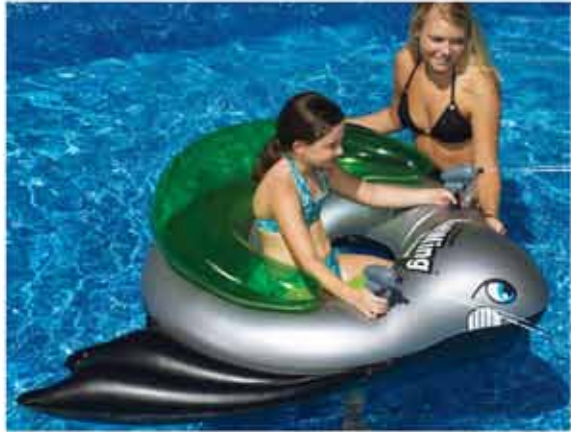
90797 Batwing 6/case $19.74 each