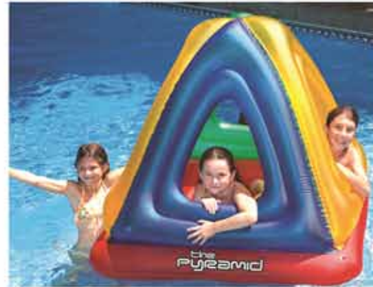
9092 Floating Pyramid 4/case $38.78 each