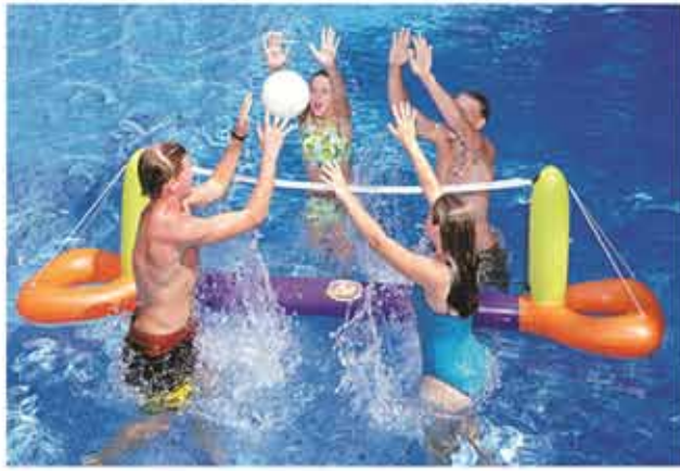
9085 Splash Volleyball 6/case $21.53 each