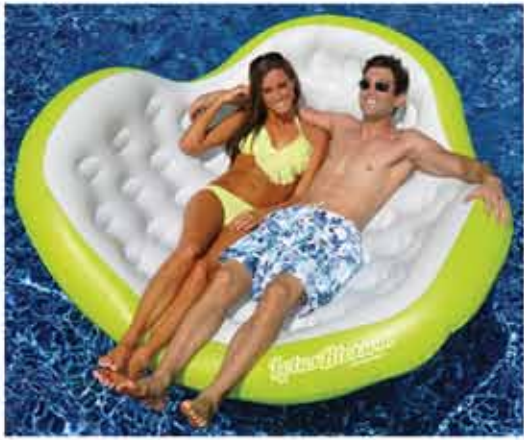
90525 Lotus Blossom Lounger 4/case $43.15 each