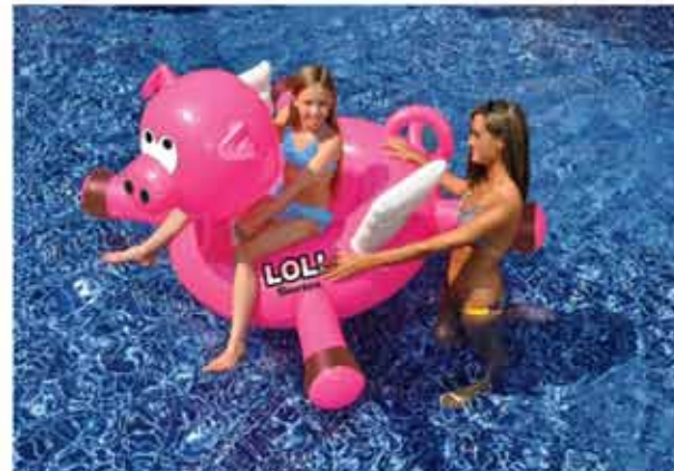
90266 Flying Pig Ride-On 6/case $20.18 each