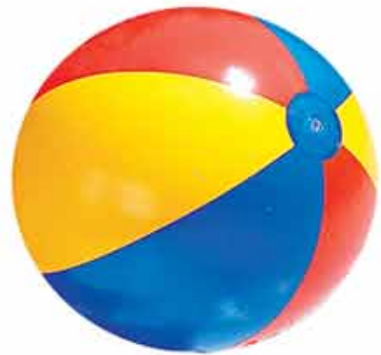
9002 46" Beach Ball 12/case $5.28 each