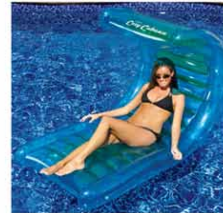
90496 Cozy Cabana 4/case $45.53 each