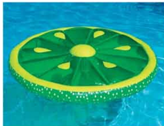
9054 Fruit Slice Island 6/case $23.95 each