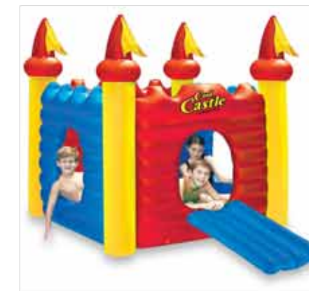
9083 Cool Castle - Also a pool with a drain 2/case $63.32 each