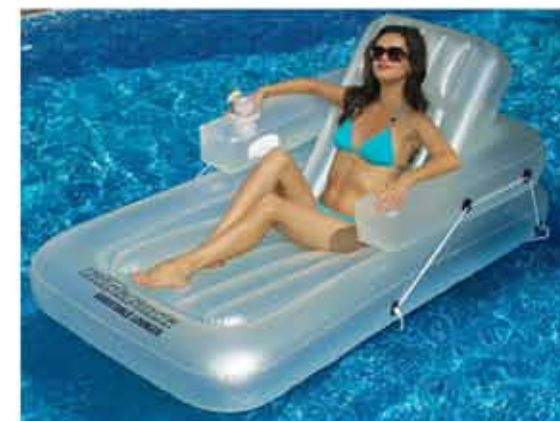
90521 Floating Adjustable Lounger 3/case $41.94 each