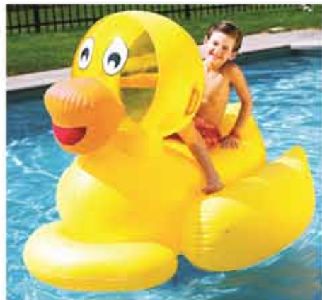
9062 Giant Duck Ride-On 6/case $21.77 each