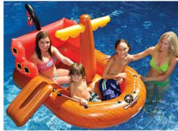
90945 Galleon Raider 4/case $38.94 each