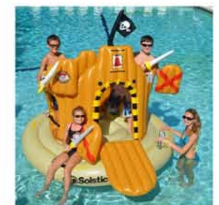
90940 Pirate Castle 1/case $91.36 each