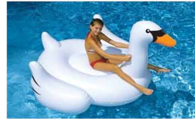
90621 Swan Lounger 4/case $24.58 each