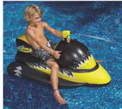
9076 Lazer Shark 12/case $18.18 each