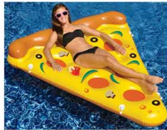
90645 Pizza Float 6/case $26.97 each