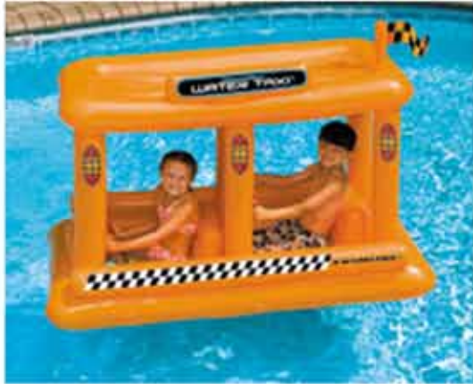
90715 Wave Taxi 2/case $32.34 each