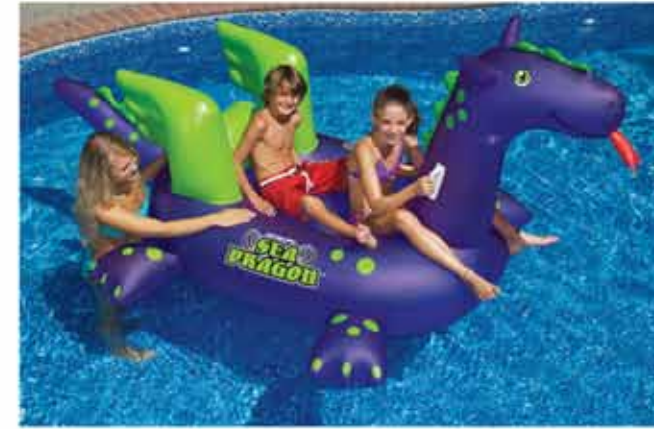
90625 Sea Dragon Ride-On 4/case $33.68 each