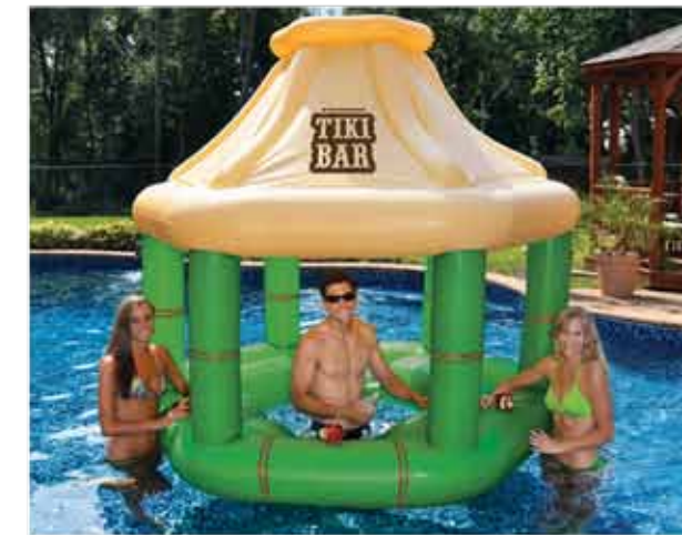
90425 Tiki Bar 2/case $107.03 each